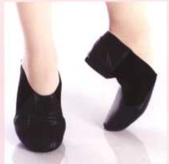
308 -Low jazz boot with neoprene/ Split rubber sole/ Leather