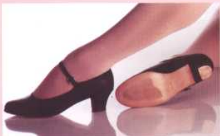
30 - 1 1/2" Heel/ Leather sole/ P.U. upper