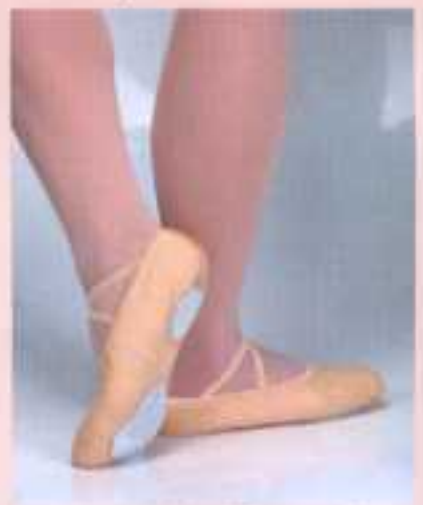
888 - Professional/ Canvas/ Split sole