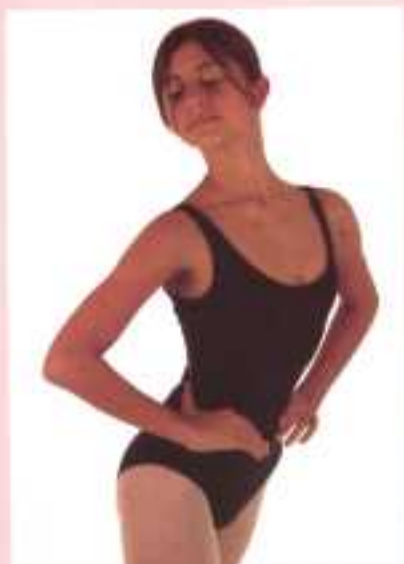
1001 - Nylon/ Tank 2001 - Cotton lycra/ Tank