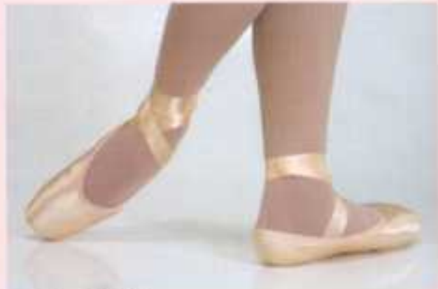
59 - Freed/ Satin