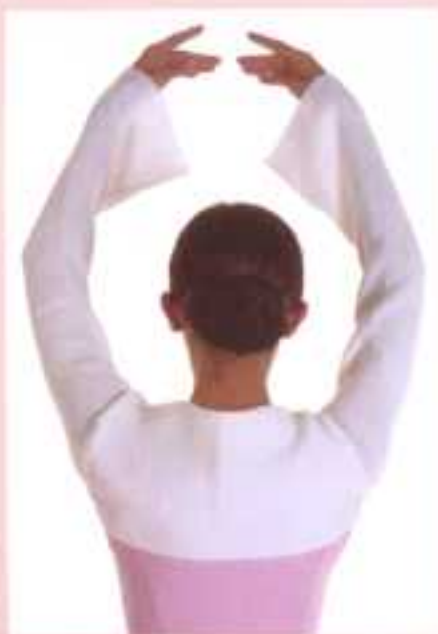
YK16 - Wrap sweater/wool