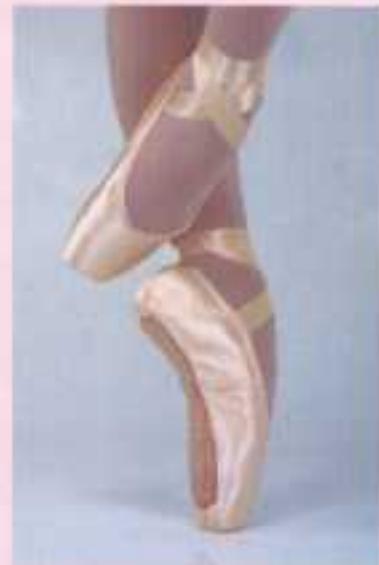
54 - Giselle-Satin

“PRESENTS DANCERS WEARING FUTURISTIC PRODUCTS”