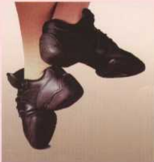
Low-top Dansneaker/ P.U. upper with nylon