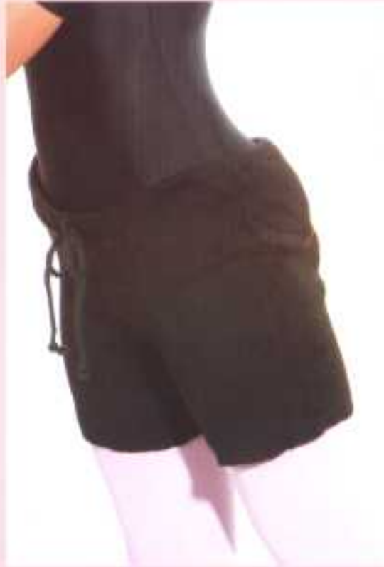
718 - Short/ Wool