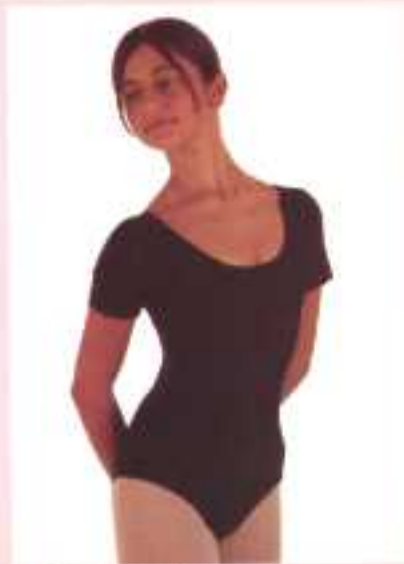
1002 - Nylon/ Short sleeve 2002 - Cotton lycra/ Short sleeve