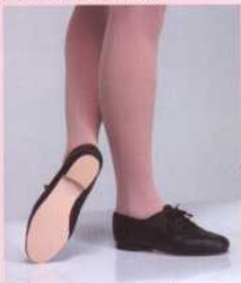
35 - Character shoes/ Leather