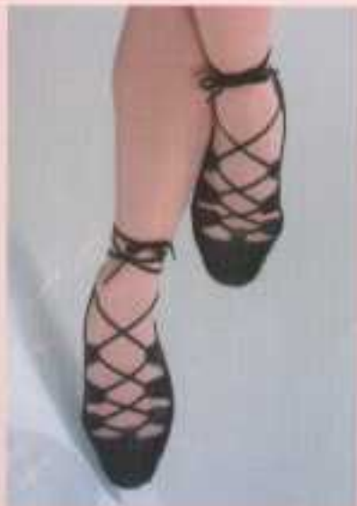
311 - Leather/ Split sole ghillie