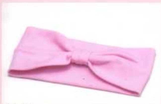
1008 - Nylon