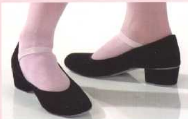
19 - 1" Heel/ Canvas Royal • 20 - 1 1/2" Heel/ Canvas Royal