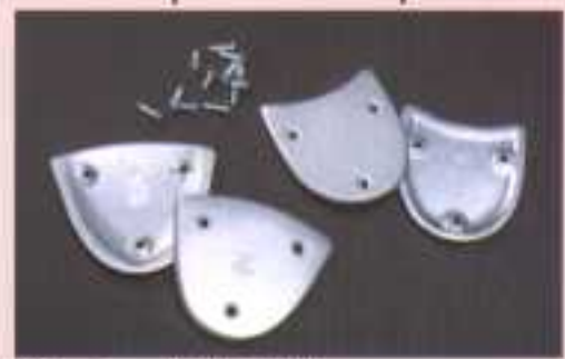
36B - Taps/Style 40/41