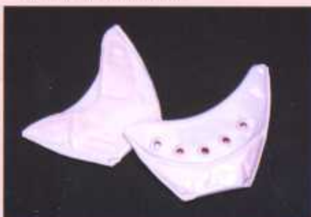
Gel Pointe Shoes Pads