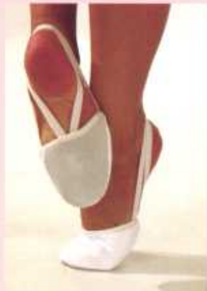
24 - GRD/ Leather