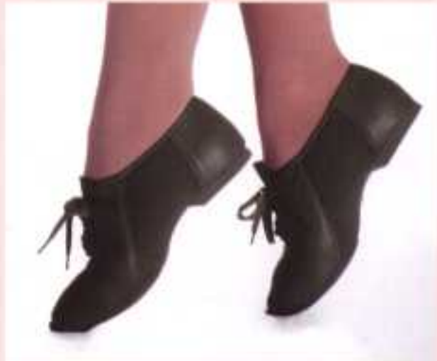
303 - Jazz shoes stretch/ Split rubber sole/ Leather