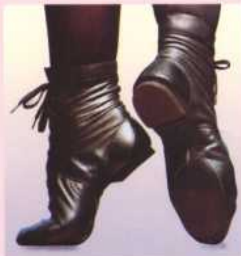
306 - Jazz boot/ Split rubber sole/ Leather