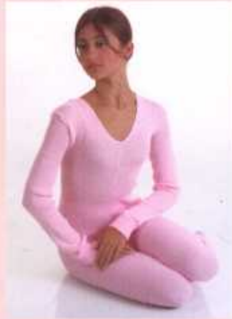
717 - Unitard/ Wool

“PRESENTS DANCERS WEARING FUTURISTIC PRODUCTS”