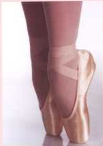
18 - Silver/ Satin