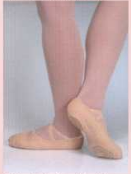
2002 - Professional/ Double canvas/ split sole