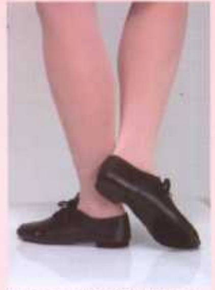
302 - Jazz shoes/ Split rubber sole/ Leather