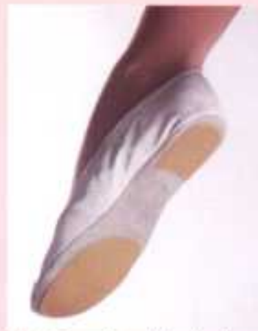
603 - Gym Shoe/ Leather/ Split sole with latex