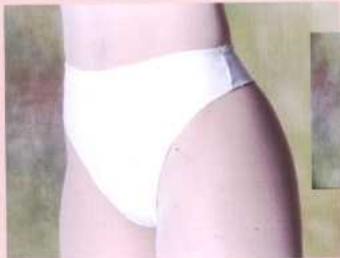
YK15 - Dance belt