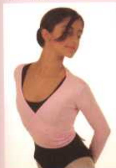
1055 - Adult/Child - Nylon