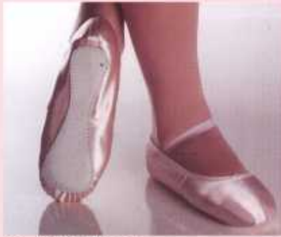
15 - Satin/ Full sole