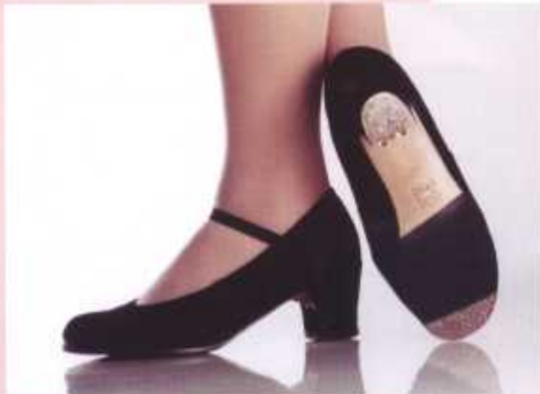
43 - Leather or Suede/ Flamenco