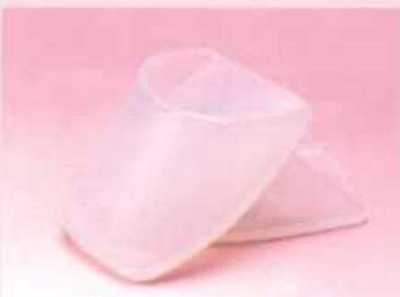
Silicon Pointe Shoes Pads