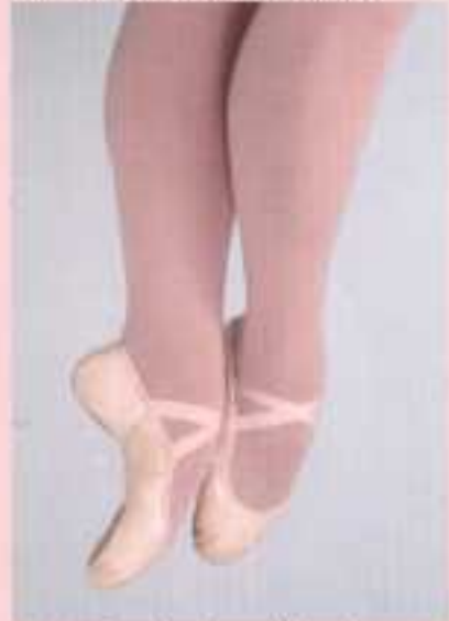
2000 - Professional/ Leather with stretch(nylon) split sole