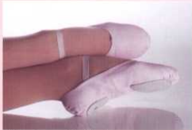
252A - Canvas/ Split sole