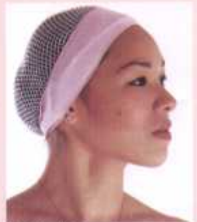
Hair Net/ Nylon