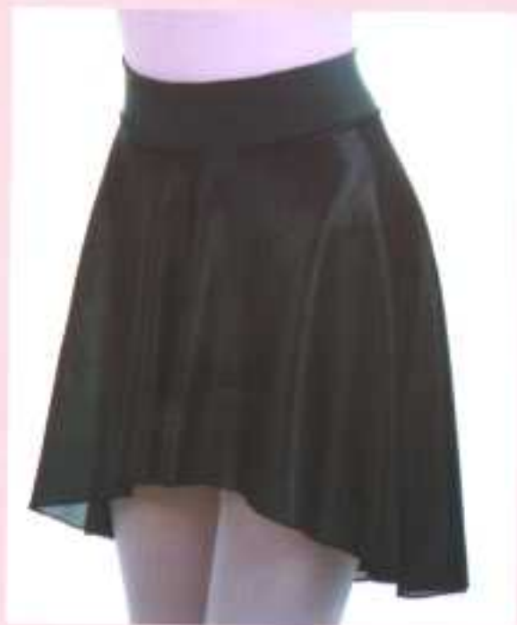
12008 - Adult/Child (Nylon with lycra waisband)

“PRESENTS DANCERS WEARING FUTURISTIC PRODUCTS”