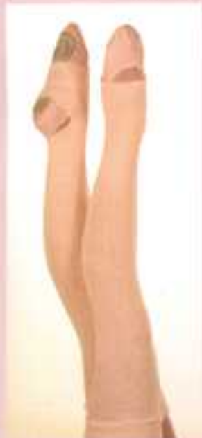
714 - Legwarmers/ wool