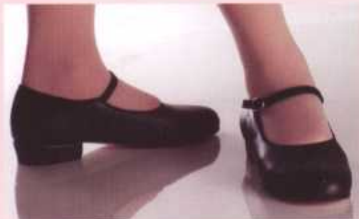
32 - 1" Heel/ P.U. upper /Leather sole