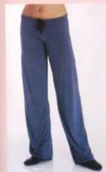
737 - Poly - Viscose/Baggy dance pant