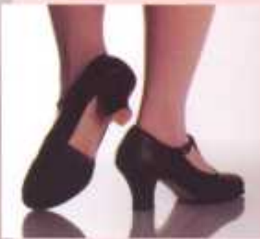
41 - T-Strap/ Leather sole/ P.U. upper