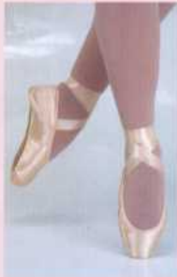
07 - Satin/ Leather toe