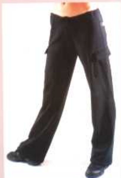
801 - Nylon/ Dance pant