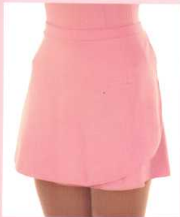
1016 - Adult/Child (Nylon)