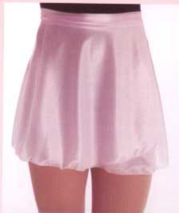
1050 - Adult/Child - (Nylon)