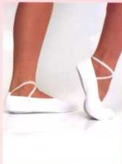
25 - Gym Shoe/ Nylon