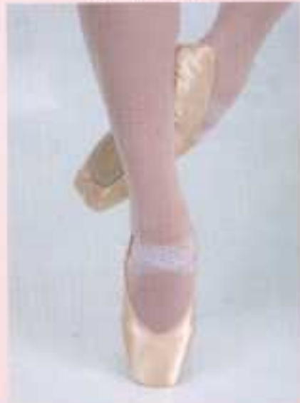
180 - Partner/ Satin/stitched sole