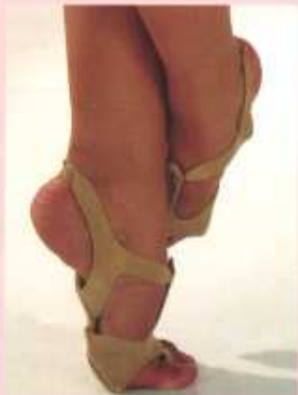
612 - Lyrical sandal/ Suede leather