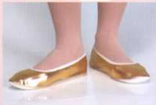
617 - Colorful/ Gold/ Silver