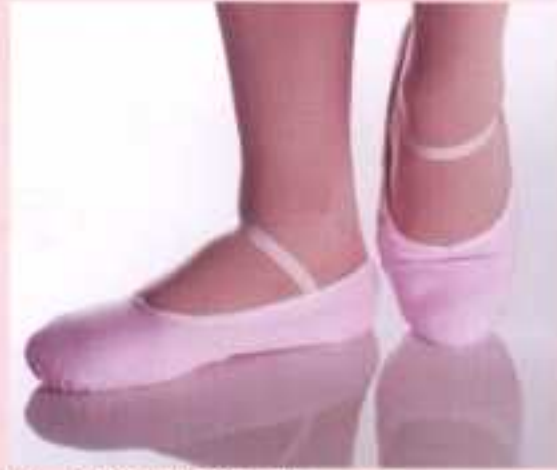
16 - Nylon/ Full sole