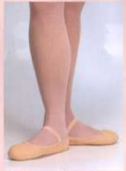
14 - Canvas/ Full sole