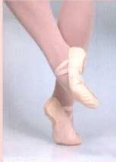
2001 - Professional/ Leather with stretch(lycra) split sole