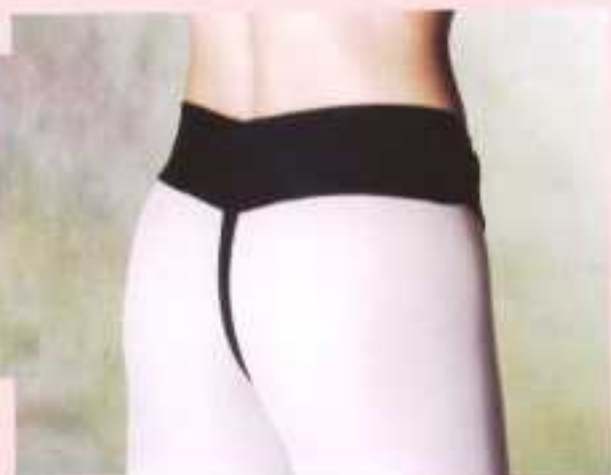
YK14 - Dance belt