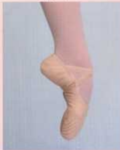
2003 - Professional/Double canvas with cushion one sole/ no heel