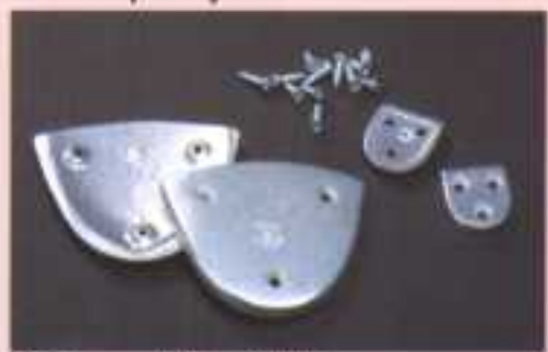
36C - Taps/ Style 30/32