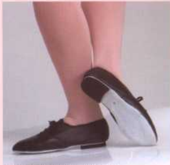
23A - Jazz flex/ Full sole/ Leather