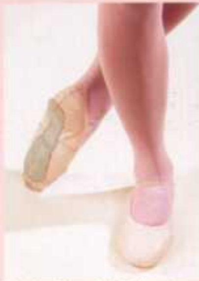
002K - Sintetic/ Full sole