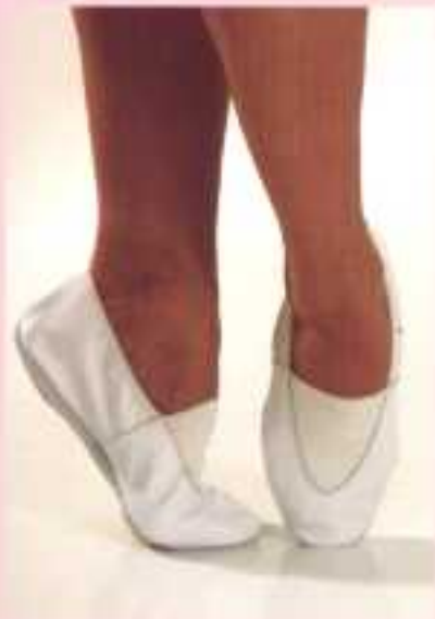
38 - Gym/ Leather with elastic/ Split sole with latex