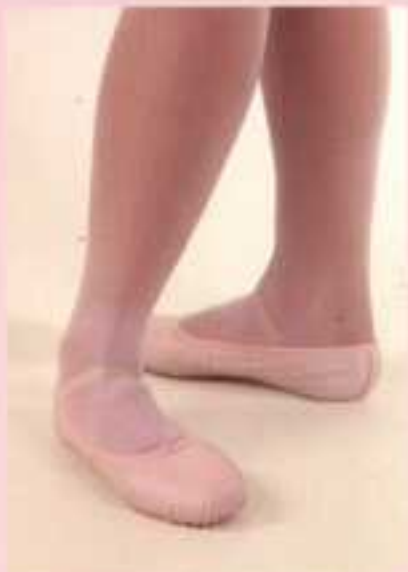
01 - Leather/ Full sole