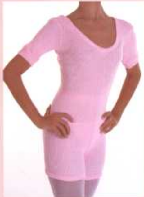
716 -Biketard/ Wool