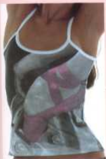
BL13 - Nylon