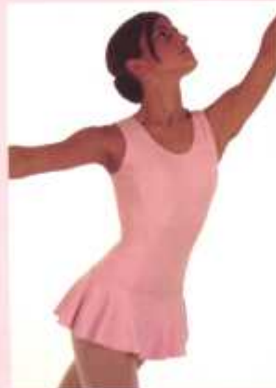
1037 - Nylon/ Tank with skirts