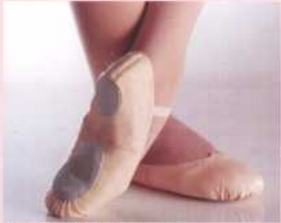
252 - Leather/ Split sole