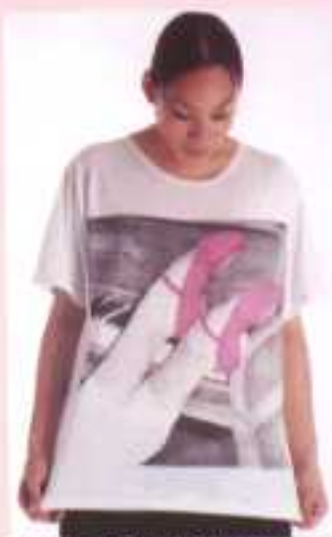
8008 - T-Shirt/ Poly-viscose