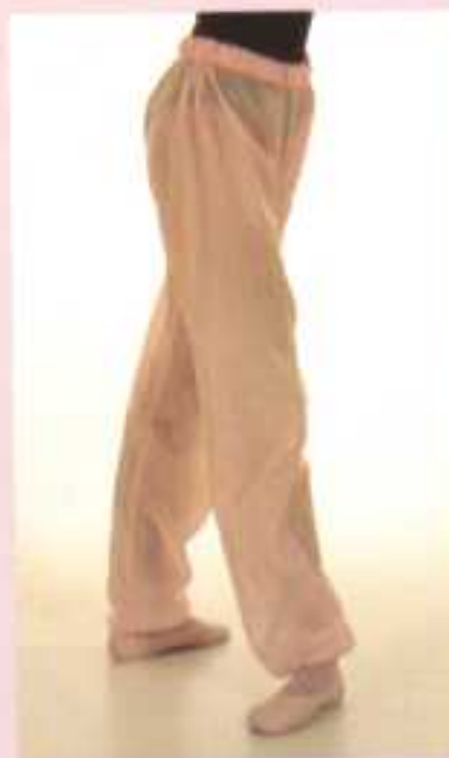
1088 - Pant/ Nylon

“PRESENTS DANCERS WEARING FUTURISTIC PRODUCTS”