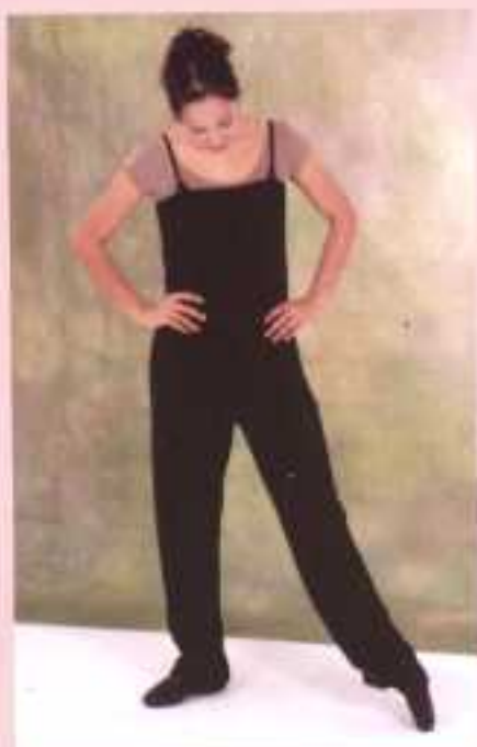
YK11 - Balli/Unitard