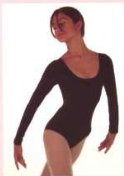
1002A - Nylon/ Long sleeve 2002A - Cotton lycra/ Long sleeve