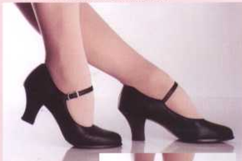
40 - Theatrical/ 3" heel/ Leather sole/ P.U. upper