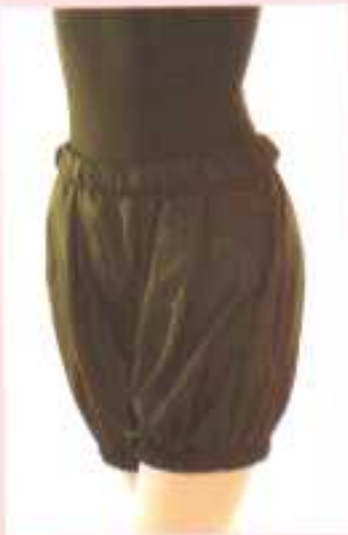
1089 - Nylon/ Short