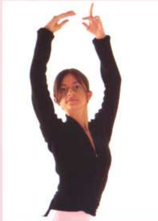
110 - Child/ Wrap sweater/ Wool 111 - Adult/ Wrap sweater/ Wool