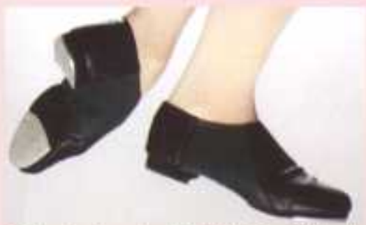
308T - Jazz Tap shoe/ Stretch/ Tap's Attached