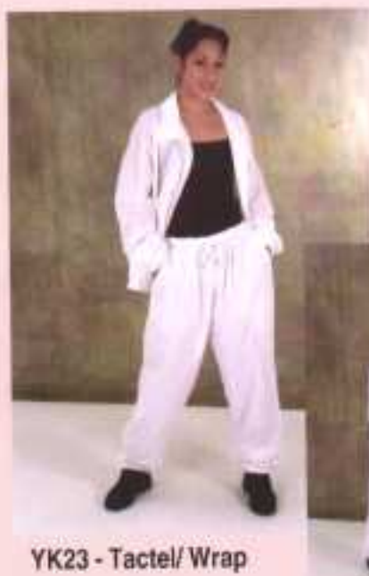
YK23 - Tactel/ Wrap