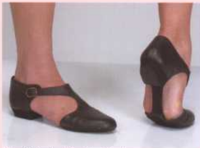
304 - Maitre/ Leather/ Stretch sole