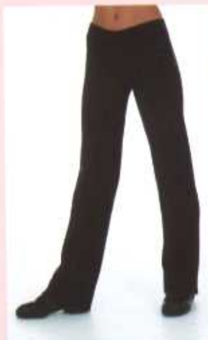
2023 - Adult/Child - Nylon/ Dance pant