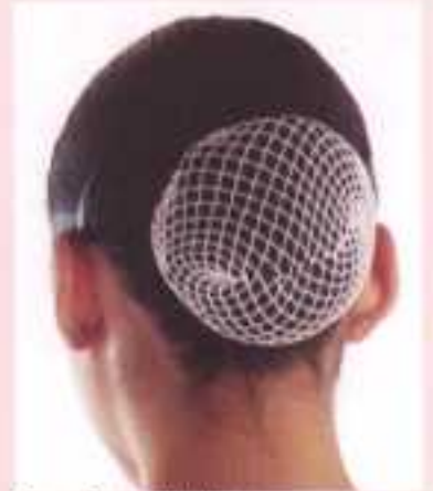
Bun Cover/ Nylon