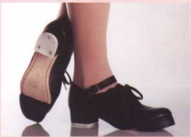
312 - Tap Irish/ Leather upper/ Leather sole and Taps

“PRESENTS DANCERS WEARING FUTURISTIC PRODUCTS”