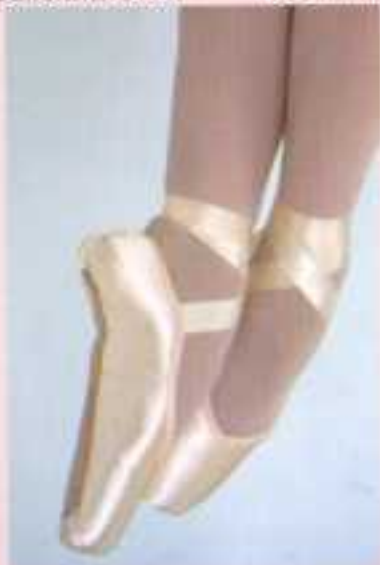
175 - Contempora I/Satin