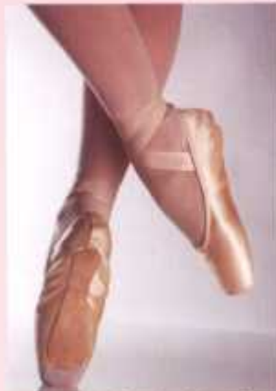
21 - Gabrielle/ Satin with suede toe