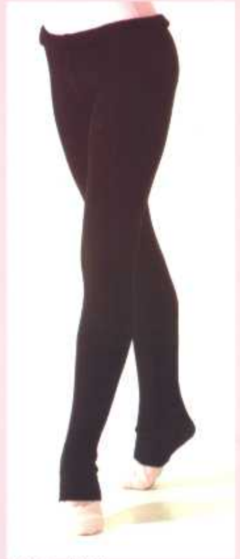
011 - Pant/ Wool