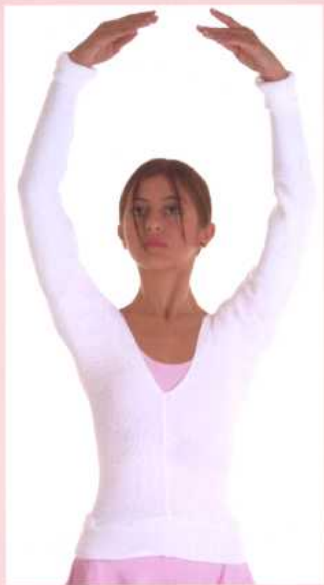
715 - Wrap sweater/ wool