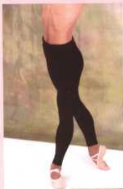
YK18 - Supplex/ Dance pant