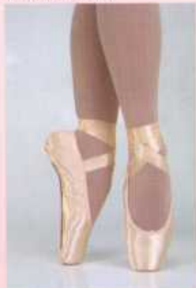
53 - Prima Ballerina/ Satin