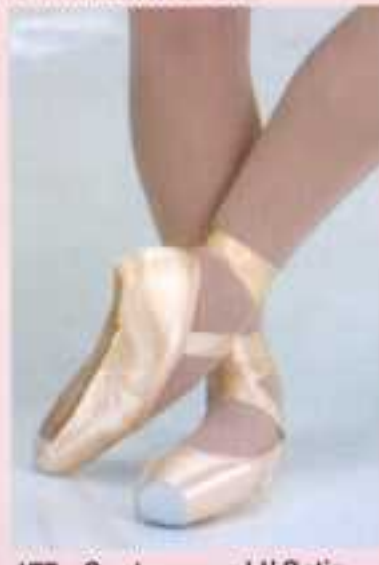
177 - Contempora I / Satin with suede toe