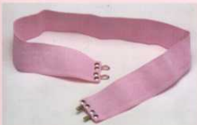
1024 - Elastic belt