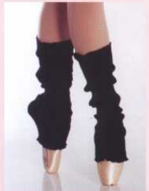
104 - Legwarmers/ Wool