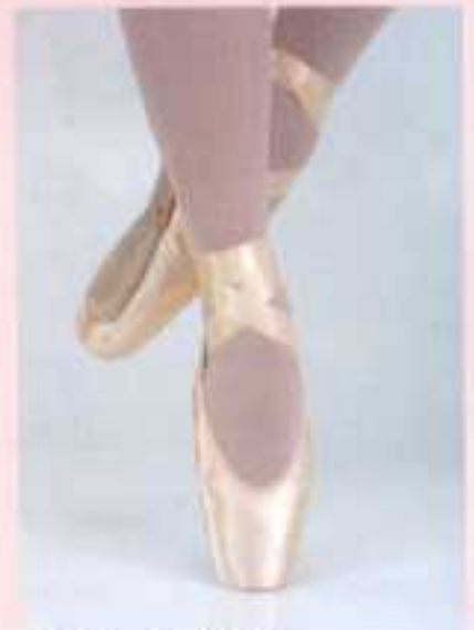
179 - Fouette/ Satin