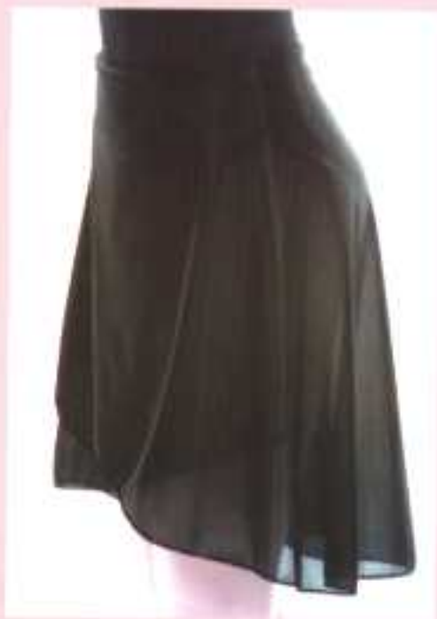
12007 - Adult/Child (Nylon)