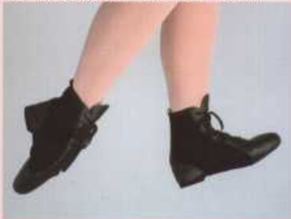
305 - Jazz boot Stretch/ Split rubber sole/ Leather