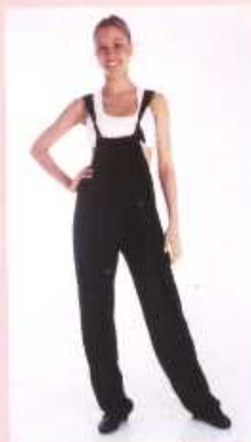
3.000 - Poly - Viscose/ Baggy dance unitard