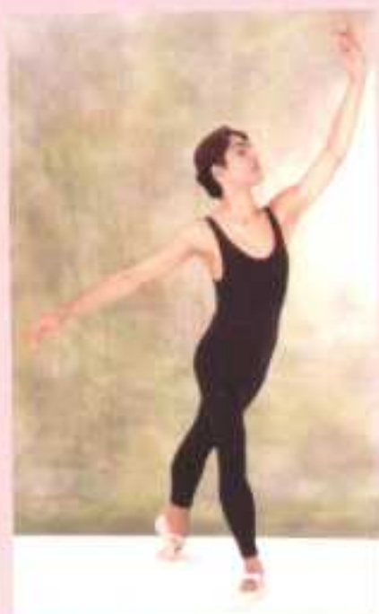
YK17 - Microfiber/ Unitard