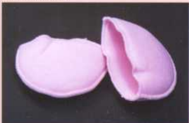
1022 - Nylon/ Foam pointe shoes pad