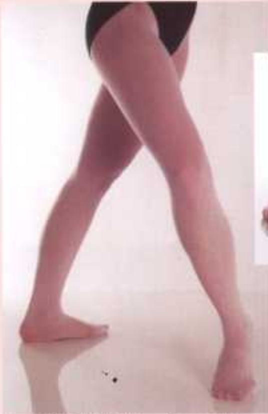
Convertible Tights/ Nylon with spandex