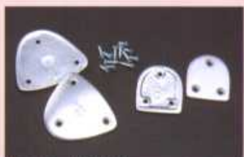
36 A - Taps/ Style 35